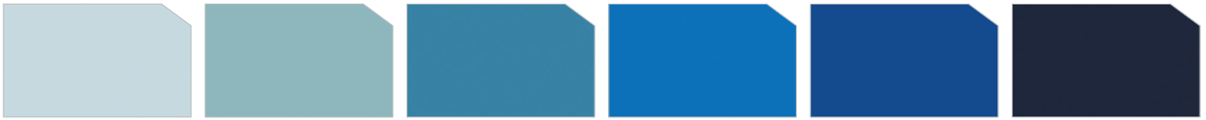
VF0706 Glacier Blue