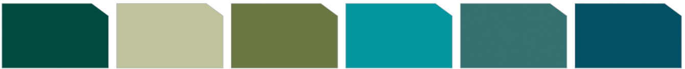
VF0591 Fir Green