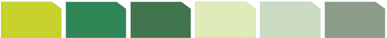
VF0725 Yellowish Green