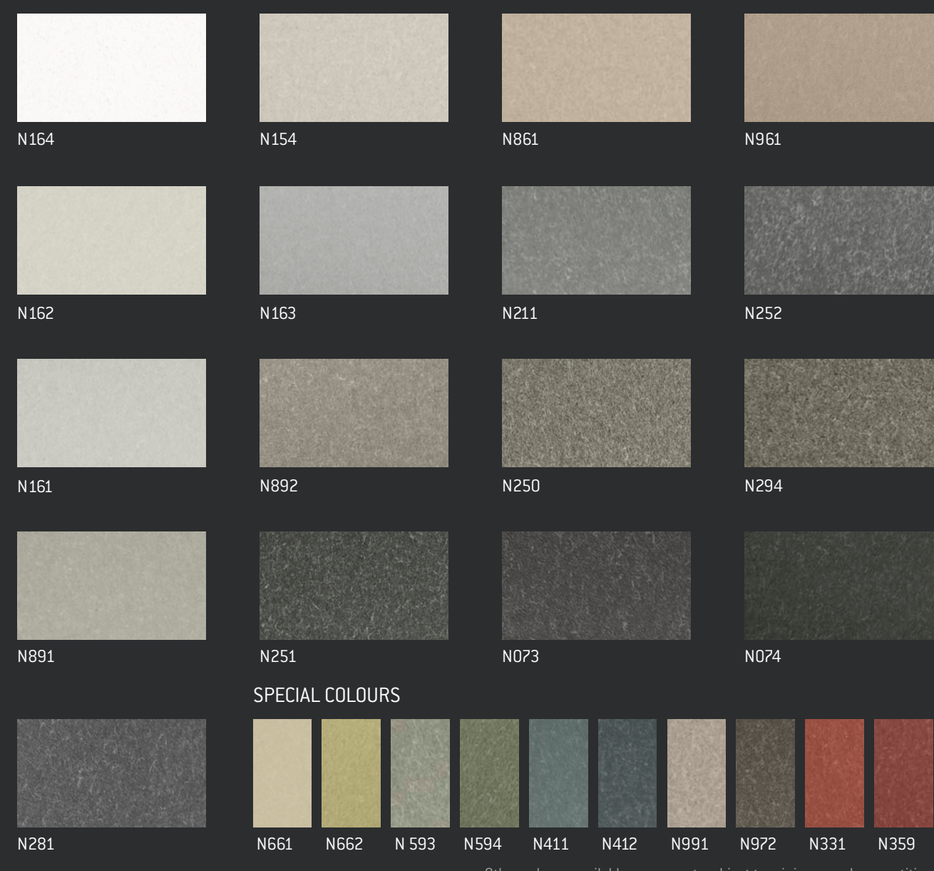
Other colours available on request, subject to minimum order quantities