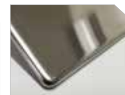
ULTRABOND Mirror Stainless