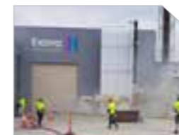
FIRESPAN AS 1530.1 Sarking