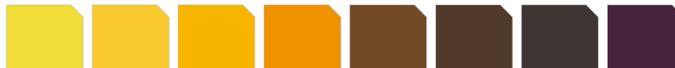
UB1016 Sulfur Yellow UB1018 Zinc Yellow UB1023 Traffic Yellow UB1037 Sun Yellow UB8008 Olive Brown UB8028 Terra Brown UB8019 Grey Brown UB4007 Purple Violet