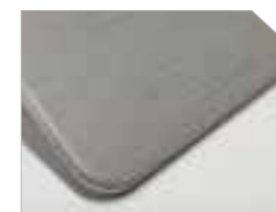
ULTRABOND Natural Zinc