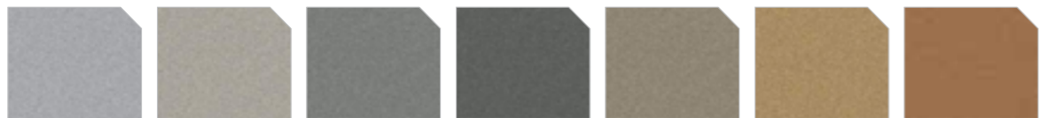
UB9701 Sterling Silver Metallic (s) UB9205 Champagne Metallic (s) UB9134 Smoke Silver Metallic (s) UB9137 Dark Grey Metallic (s) UB9308 Bronze Metallic (s) UB4150 Gold Metallic UB9809 Copper Metallic