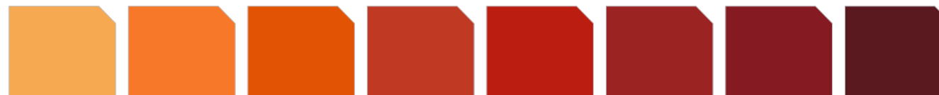
UB1017 Saffron Yellow UB2003 Pastel Orange UB2004 Pure Orange UB2002 Vermilion UB3020 Traffic Red UB3001 Signal Red UB3003 Ruby Red UB3005 Wine Red