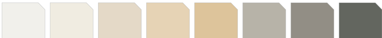
UB9016 Traffic White UB9010 Pure White UB1013 Oyster White UB1015 Light Ivory UB1014 Ivory UB7044 Silk Grey UB7030 Stone Grey UB7005 Mouse Grey