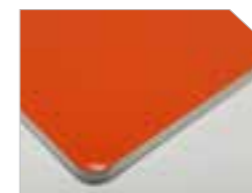
ULTRABOND Solid Colours