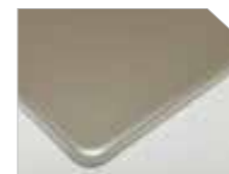
ULTRABOND Metallic Colours