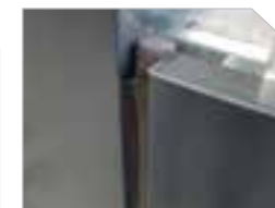
JOINT SEALANT Prolastik & Sikaflex

*For types A & B construction, use ULTRACORE non-combustible aluminium core panel - see page 2.