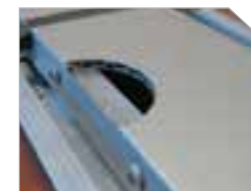
EXTRUSIONS Z-angles & Trims