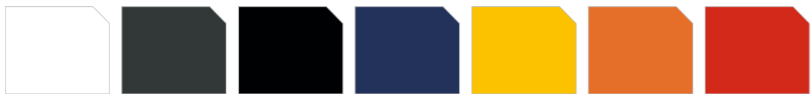
UB1005 Arctic White (s) UB1255 Volcanic Grey UB9130 Carbon Black (s) UB1460 Royal Blue UB1140 Atomic Yellow UB1190 Pilbara Orange UB1677 Centurion Red (s)