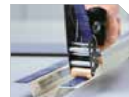
TAPES & GASKETS Foil & Foam Tapes