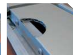
TRIMS & Z-ANGLES Specialised Cladding & Decking Fixings