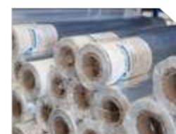
FIRESPAN AS 1530.1 Sarking