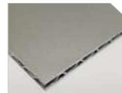
ULTRACORE IQ Metallic Colours