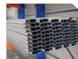
BICEP & STUDTEK Steel Facade System