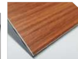
ULTRACORE IQ Imitation Finishes