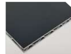
ULTRACORE IQ Solid / Matt Colours