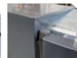
JOINT SEALANT Prolastik & Sikaflex