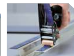
TAPES & GASKETS Foil & Foam Tapes