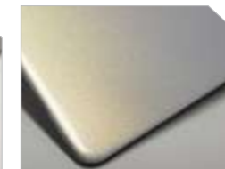
ULTRACORE IQ Chromatic Colours