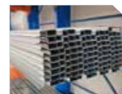
STUDTEK Steel Sub-framing