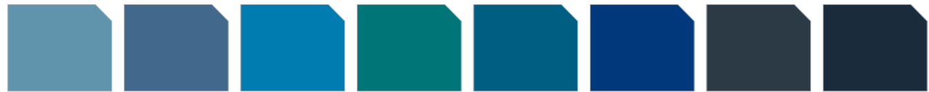
US5024 Pastel Blue US5023 Distant Blue US5015 Sky Blue US5021 Water Blue US5019 Capri Blue US5002 Ultramarine Blue US5008 Grey Blue US5011 Steel Blue