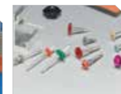
COLOURFIX Coloured Fixings