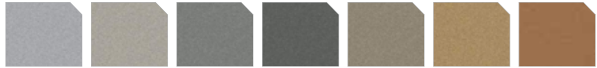
US9701 Sterling Silver Metallic US9205 Champagne Metallic US9134 Smoke Silver Metallic US9137 Dark Grey Metallic US9308 Bronze Metallic US4150 Gold Metallic US9809 Copper Metallic