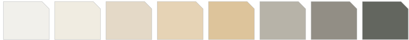
US9016 Traffic White US9010 Pure White US1013 Oyster White US1015 Light Ivory US1014 Ivory US7044 Silk Grey US7030 Stone Grey US7005 Mouse Grey