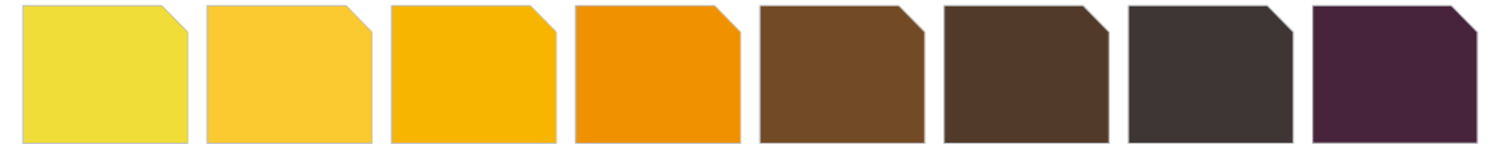
US1016 Sulfur Yellow US1018 Zinc Yellow US1023 Traffic Yellow US1037 Sun Yellow US8008 Olive Brown US8028 Terra Brown US8019 Grey Brown US4007 Purple Violet