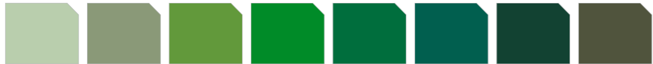
US6019 Pastel Green US6021 Pale Green US6018 Yellow Green US6037 Pure Green US6029 Mint Green US6026 Opal Green US6005 Moss Green US6003 Olive Green