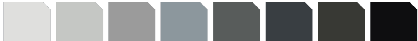
US9002 Grey White US7035 Light Grey US7004 Signal Grey US7000 Squirrel Grey US7011 Iron Grey US7016 Anthracite Grey US7022 Umbra Grey US9005 Jet Black