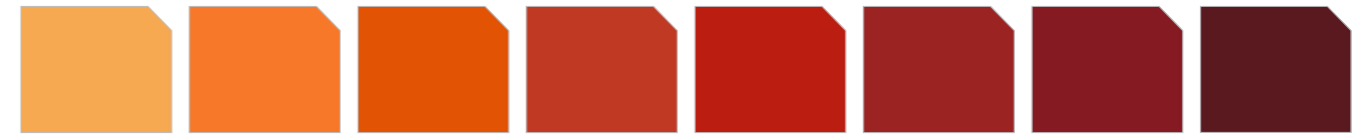
US1017 Saffron Yellow US2003 Pastel Orange US2004 Pure Orange US2002 Vermilion US3020 Traffic Red US3001 Signal Red US3003 Ruby Red US3005 Wine Red