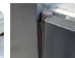
JOINT SEALANT Prolastik & Sikaflex