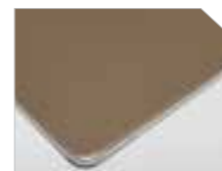
ULTRASURE Metallic Colours