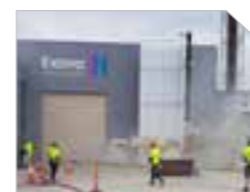
FIRESPAN AS 1530.1 Sarking