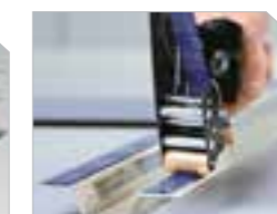
TAPES & GASKETS Foil & Foam Tapes