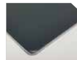
ULTRASURE Solid Colours