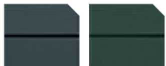
C19 Ocean C31 Forrest