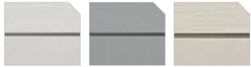
C01 White C05 Grey C07 Cream White