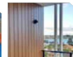
CLADTRIM Colour-match Trims