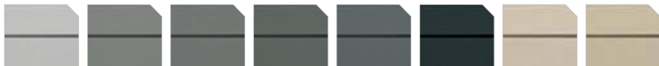
C51 Silver C52 Pearl C56 Platinum C53 Nickel C54 Pewter C50 Black C02 Beige C08 Sand Yellow