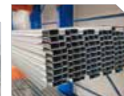
STUDTEK Steel Sub-framing