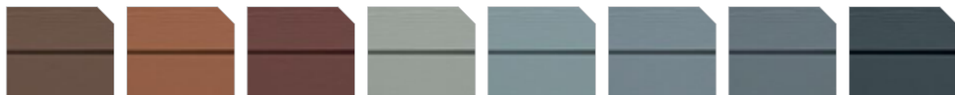
C30 Earth C32 Red Brick C61 Burnt Red C06 Grey Green C10 Blue Grey C62 Violet Blue C15 Dark Grey C18 Slate Grey