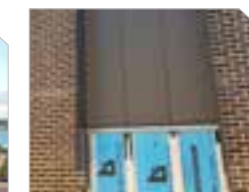
ADHESIVES SikaTack & 11FC