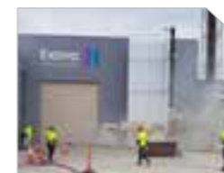
FIRESPAN AS 1530.1 Sarking