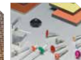
COLOURFIX Coloured Fixings