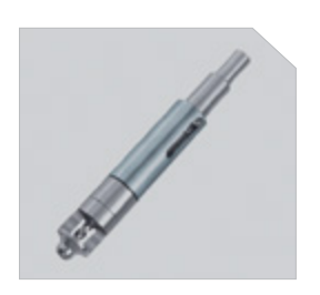
CFDB10 10mm Drill Bit