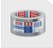
ITP**50 Reinforced Foil Tape