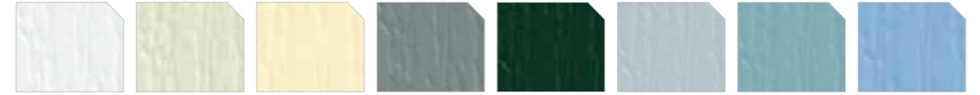
SK6010 Dawn White SK6060 Moss White SK6860 Moon White SK6170 Soft Fog SK6090 Deep Moss SK6310 Polar SK6210 Sea SK6320 Soft Ocean