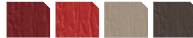
SK6650 Bright Volcanic SK6400 Royal Red SK6740 Turf SK6730 Ashes