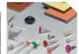
COLOURFIX Coloured Fixings

*For types A & B construction, use ULTRAWOOD non-combustible aluminium cladding - see page 52.