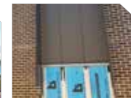
ADHESIVES SikaTack & 11FC