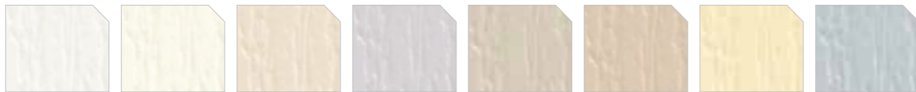
SK6360 Coast White SK2150 Cream White SK6660 Lava White SK6510 Stone White SK6710 Ashes White SK6760 Earth White SK6810 Dune White SK6260 Arctic White