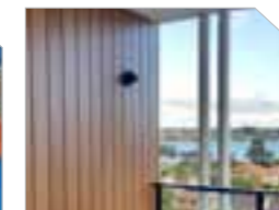
CLADTRIM Colour-match Trims