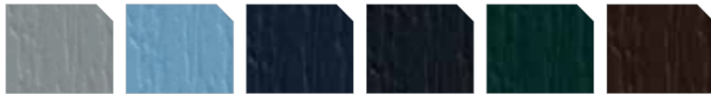
SK6370 Soft Coast SK6270 Soft Arctic SK6340 Deep Ocean SK6390 Deep Coast SK6140 Deep Reed SK6790 Deep Earth