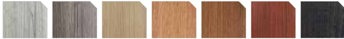
SK1560 White Birch (s) SK1570 Silver Oak (s) SK0820 Cedar SK1520 White Oak (s) SK1540 Dark Cedar (s) SK1510 Meranti (s) SK1580 African Ebony (s)