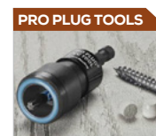
Depth Setting Tool