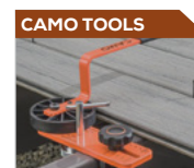
Specialist Fixing Tools