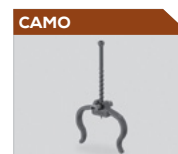
Secret Fixing Clips