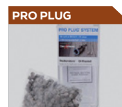
Secret Fixing Plugs