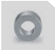
CFFPS Rivet Sleeve