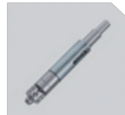
CFCT10 Centralising Tool