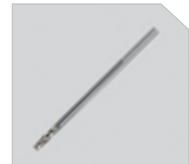
CFDB51 Replacement Bit