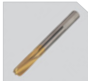
CFDB10 10mm Drill Bit