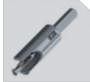
TSUDL Depth Locator