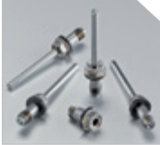
TS6CA** Concealed Anchors