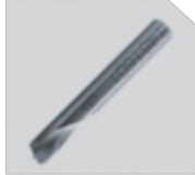
TS6DB9/12 9mm/12mm Drill Bit